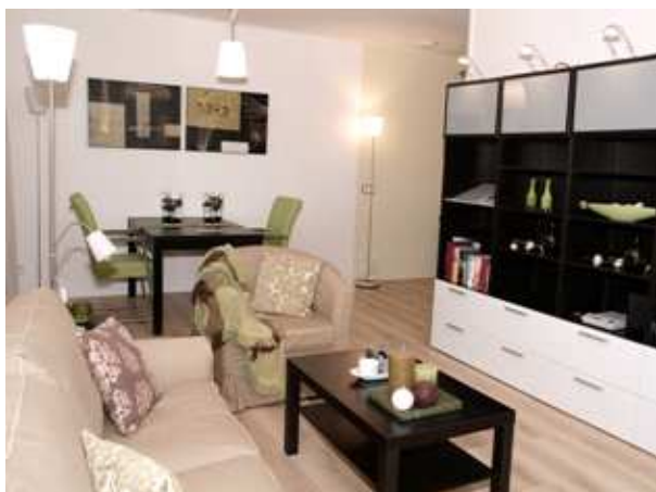
Fig. 2. Comfort, safety and Low vision dwelling, view of the living room

knowledge about the use of smart technologies at home for ageing-in-place. In addition, more understanding was gained about how potential dwellers such as persons with