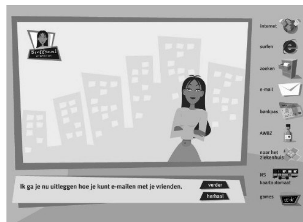
Figure 3. Screen agent Steffie

Steffie is a screen agent designed in Flash and developed as a part of a website (www.steffie.nl) where she features as a talking guide, explaining the internet, e-mail, health insurance, cash dispensers and railway ticket machines.