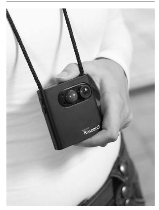
Figure 4. SenseCam: A wearable camera that can automatically take pictures to supplement memory

The SenseCam has been integrated into a slightly more advanced system called MemExerciser<sup>56</sup> that also collects audio and GPS location information. These data are automatically compiled by a coupled software program CueChooser (still in development) that automatically assigns context to image sets based on location, movement, and photograph contents (i.e. presence of faces), allowing for the individual to use the software without caregiver intervention. Three patients with episodic memory impairment were used to compare the self-guided MemExerciser