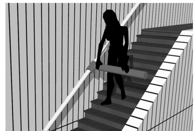
Figure 1. Descending stairs safely with a removable rail in front of user 3

W.J.M.J. VAN DEN BOUWHUIJSEN, R. DIJKMAN. AEM-cube design. Gerontechnology 2012;11(2):111-112; doi:10.4017/gt.2012.11.02.567.00 Purpose Basic principles of design are aesthetics, functionality, and regulations. Our physical and instinctive characters hardly change 1 . People, especially the elderly, will feel better if a design is based on their culture and behaviour, because they have more difficulties to accommodate new situations. Method 'The AEM-Cube' 2-3 is one of the models to compose effective teams based on the diversity of team members during the growing phase of an organization. The model is based on the need of an organization (S