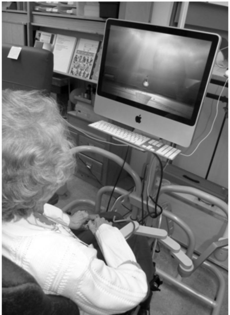
Figure 1. Playing a game using the supported human arm as a joystick