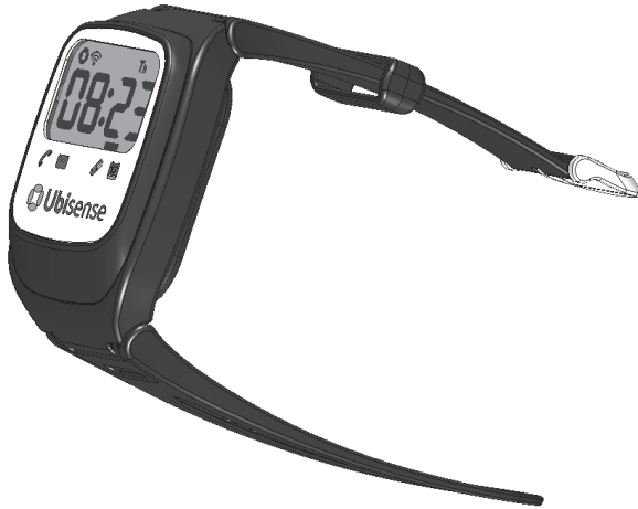
Figure 1. The Ubiwatch ordinarily displays the time and day of the week. The programmable display will show four-character words such as PILL or APPT. By pressing the display face the display can be adjusted and requests for help can be sent

tion-aware technology to deliver on-demand customized prompts and reminders to Veterans with traumatic brain injury when they are located in a specialized residential treatment living facility 2 . Part of the floor plan of the facility is shown in Figure 2 . The Ubiwatch may be used to prompt patients to attend to the customized message displayed on screens located throughout the facility.