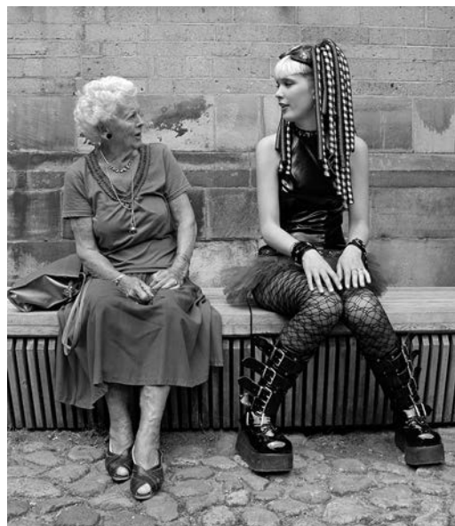
Figure 1. Clothing differs but communication goes deep!

When viewing chatting between adult grandchild and grandparent in general, their outlook may dif-