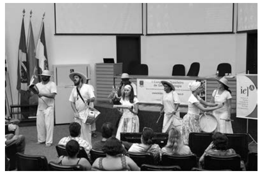
A cultural presentation: Maracatu, Chapéu do Sol (hat of the sun)

to change their way of thinking. It is also necessary to highlight that, in the process of learning, it is not only the memory that is being worked, but social and also emotional interaction aspects that are of fundamental importance. Once ensured that the LLL concept is broadcasted among the elderly by law, then the linking of the guidelines of this research is initiated: Technological Inclusion of individuals aging in a society of constant technological and scientific changes. Recognizing that the aging process is worldwide leads to enhancing a growing demand for innovation, particularly on new technologies of information and communication, called by some authors, as a development stage: Society and Technology. As a process related directly to the age of the users, it is thought that older people use less technology, however, this situation has been changing gradually as a significant number of elderly people are actually using or beginning to use it. In Portugal, almost all senior universities offer classes of technology use, which becomes the most popular among the elderly.