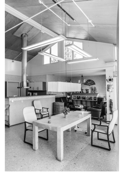
Figure 2. The living room with the sound absorption panels installed (l) and the control living room (r).

received the new situation well. They experienced that the reverberation was less than before. They said, "there is an obvious difference between the two living rooms next to each other". The healthprofessionals care gave remarks about the living room being more quiet and peaceful. They said, "I felt less tired than in the other living room". Another remark they made was: "I can do my work better". In addition, the healthcare professionals can have a conversation with the