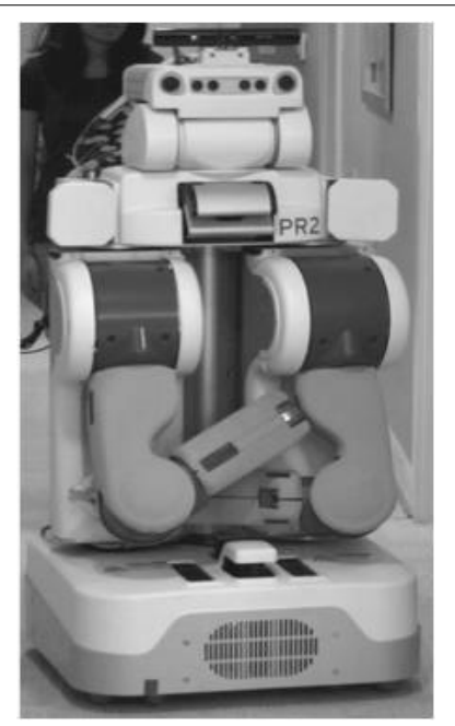
Figure 1. PR2 mobile manipulator robot

The present research aimed to understand the perspective of professional healthcare providers about assistance from a mobile manipulator robot in the context of working with older adults in care facilities. Given current healthcare workforce shortages and the momentum in healthcare robot development, it is guite possible that robotic healthcare assistants could become more commonly used in the near future. Healthcare providers may not have a choice in terms of whether they work with a robot assistant, yet they may play a role in deciding/managing which tasks the robot performs. There is some evidence that older adults are open to receiving assistance from a robot<sup>19-21</sup>; it is unclear whether their professional care providers are open as well. Hence, the main objectives of this study were to gain insight about healthcare providers' preferences for assistance (human vs. robot) for a wide variety of healthcare tasks, and their acceptance of and attitudes about robotic assistance. We employed qualitative methods given their ability to provide rich information about the nature of individuals' preferences for and attitudes about emerging technologies, such as robots<sup>19,21,22</sup>. The results provide useful guidance