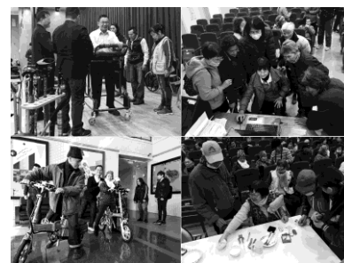
Figure 2. 122 Nan Kai University students helped 100 older adults to experience assistive technology