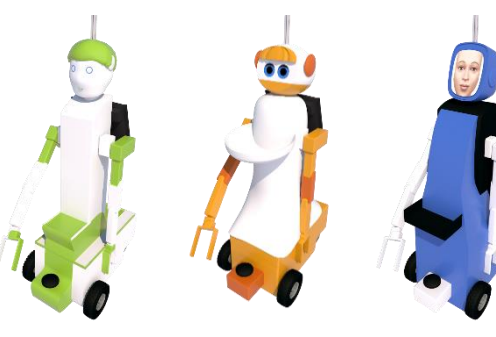
Figure 2: Model 1, 2 and 3 (from left) from the first evaluation phase in different colours (Models: J. Sehrt)