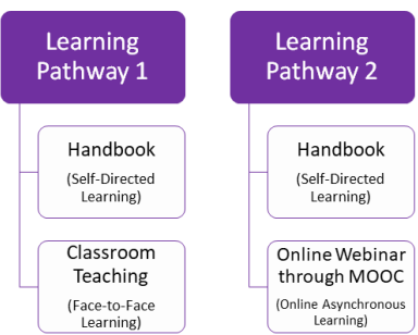
Figure 1: The two learning pathways of the certificate course

Acknowledgement The project is funded by the Erasmus+ Programme of the European Union (Grant Agreement No. 612655-EPP-1-2019-1-EL-EPPKA2-SSA)