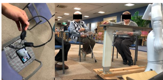
Fig 1. The potable tablet with a headset for teleoperation (left) and participants interacting with the Pepper robot (right)