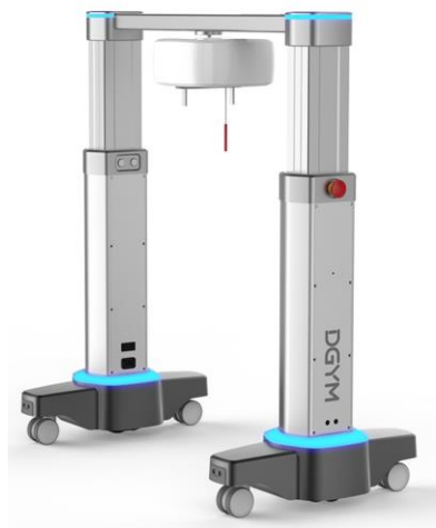
Figure 1. Patient-transfer robot

Acknowledgement This research was supported by a grant from the Korea Health Technology R&D Project through the Korea Health Industry Development Institute (KHIDI), funded by the Ministry of Health & Welfare, Republic of Korea (grant number: HK20C0007).