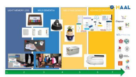
Figure 1. HAAL products to support the dementia stages (GDS 1-7)

Acknowledgement: We gratefully acknowledge support from the Active Assisted Living (AAL) Programme, co-financed by the European Commission through the H2020 Societal Challenge: Health, demographic change, wellbeing. In particular, the work reported here has been supported by the AAL HAAL project (AAL-2020-7-229-CP).