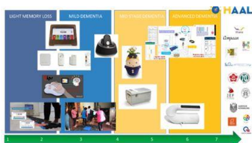
Figure 1. HAAL products to support the dementia stages (GDS 1-7)

Acknowledgement: We gratefully acknowledge support from the Active Assisted Living (AAL) Programme, co-financed by the European Commission through the H2020 Societal Challenge: Health, demographic change, wellbeing. In particular, the work reported here has been supported by the AAL HAAL project (AAL-2020-7-229-CP).