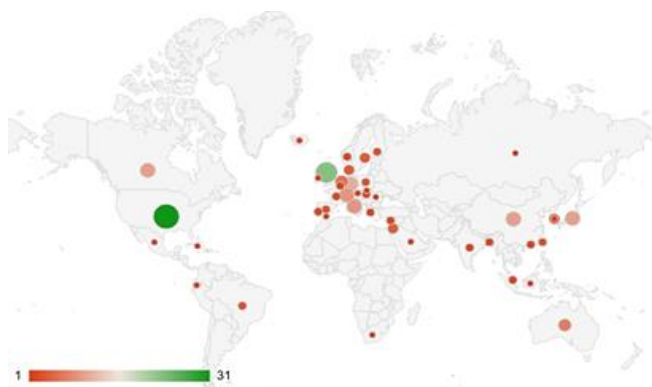
Figure 1. Geographic distribution of studies found by country

Acknowledgement: This research was supported by “Conselho Nacional de Desenvolvimento Científico e Tecnológico” and “Fundação Coordenação de Aperfeiçoamento de Pessoal de Nível Superior”