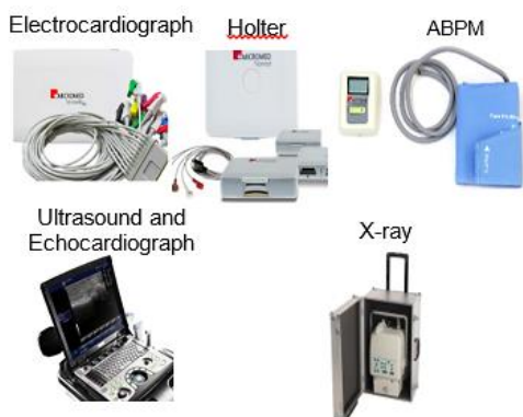
Figure 1. Portable equipment used by the company to carry out imaging diagnostic services at home

Acknowledgement: This research was supported by the "Fundação de Amparo à Pesquisa do Estado de São Paulo" (FAPESP) – Finance Number 2023/05218-6 and "Coordenação de Aperfeiçoamento de Pessoal de Nível Superior" - (CAPES) - Finance Code 001. We also acknowledge the "Programa de Pós-Graduação Interunidades em Bioengenharia (PPGIB) da Universidade de São Paulo (EESC-FMRP-IQSC/USP)".