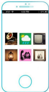
Figure 2. Experimental group: nostalgic icon design (image designed by the author)

Statistical analysis results: The first-pass recognition accuracy of the nostalgic icon group was significantly higher than that of the control group ( t(14) = 6.58, p < 0.001 , Cohen's d = 1.70 , 95% CI [1.02, 2.38]). Task completion time was significantly shorter than the control group ( t(14)