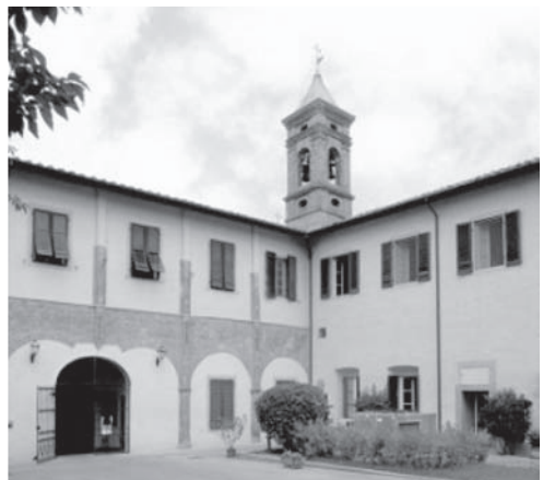
Entrance of Polo Sant'Anna Valdera restored in 2002

The Scuola Superiore Sant'Anna (SSSA, http://www.sssup.it ) in Pisa is a public, residential university offering opportunities in research and advanced studies in social sciences (economics and management, law, political science) and experimental sciences (engineering, medicine and agricultural science). The School's mission is to educate students in a stimulating and active academic environment offering personalised undergraduate tutoring, graduate programs (master's and doctoral programs), and continuing education professional courses. The School participates in multiple and growing international networks of academic and other research institutions, exchanging programs with international professional and business associations, industry and public agencies in various research areas such as ap-