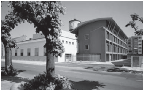
The newly built CRIM Lab of the Scuola, in use since 2003

The CRIM Lab (Centre for Research in Micro-engineering) was established at the SSSA with the specific mission to perform applied research on micro-mechatronics mainly in the biomedical field, and to implement service activities aimed at promoting the industrial take-up and exploitation. The CRIM Lab has more than 40 full time researchers possessing interdisciplinary expertise; a variable number of graduate students are also involved.