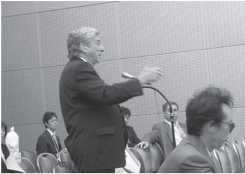
Lively discussion (James Fozard)