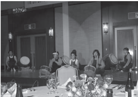
Amazing drumming at the banquet