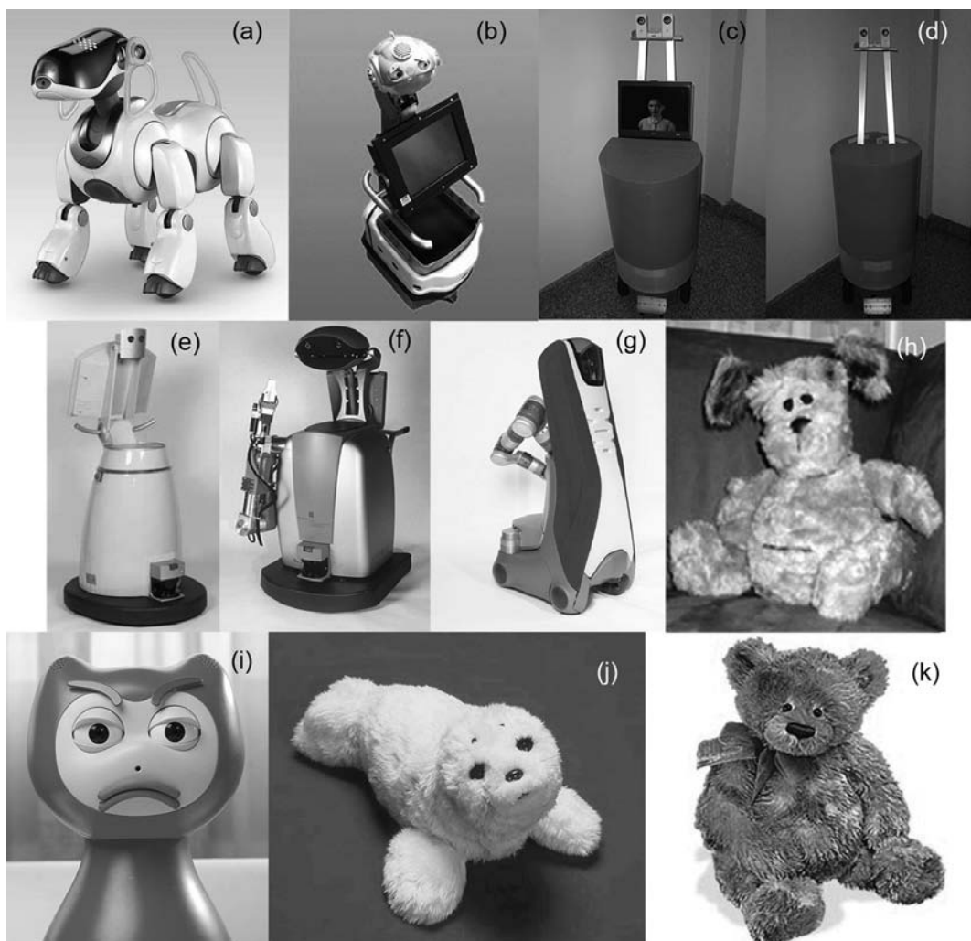
Figure 2. Assistive social robots; (a) Aibo, (b) Pearl, (c) Robocare with screen, (d) Robocare without screen, (e) Care-o-bot I, (f) Care-o-bot II, (g) Care-o-bot III, (h) Homie, (i) iCat, (j) Paro and (k) Hugable

Aibo is an entertainment robot developed and produced by Sony ( Figure 2a ) 13 . It is currently out of production. It has programmable behavior, a hard plastic exterior and has a wide set of sensors and actuators. Sensors include a camera, touch sensors, infrared and stereo sound. Actuators include four legs, a moveable tail, and a moveable head. Aibo is mobile and autonomous. It can find its power supply by itself and it is programmed to play and interact with humans. It has been used extensively in studies with the elderly in order to try to assess the