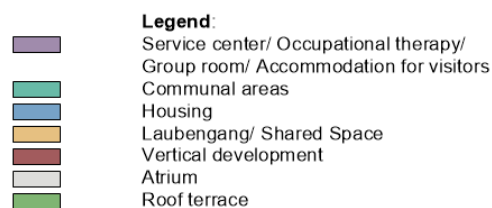
Figure 1. Utilisation concept & possible residents - ground floor to top floor