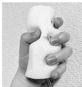
Figure 2. Control part made using 3D scanning.