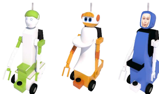
Figure 2: Model 1, 2 and 3 (from left) from the first evaluation phase in different colours (Models: J. Sehart)