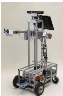
Figure 1: The robot platform ROSWITHA

Acknowledgement: The Project is funded by the Commerzbank Foundation, Frankfurt am Main, Germany